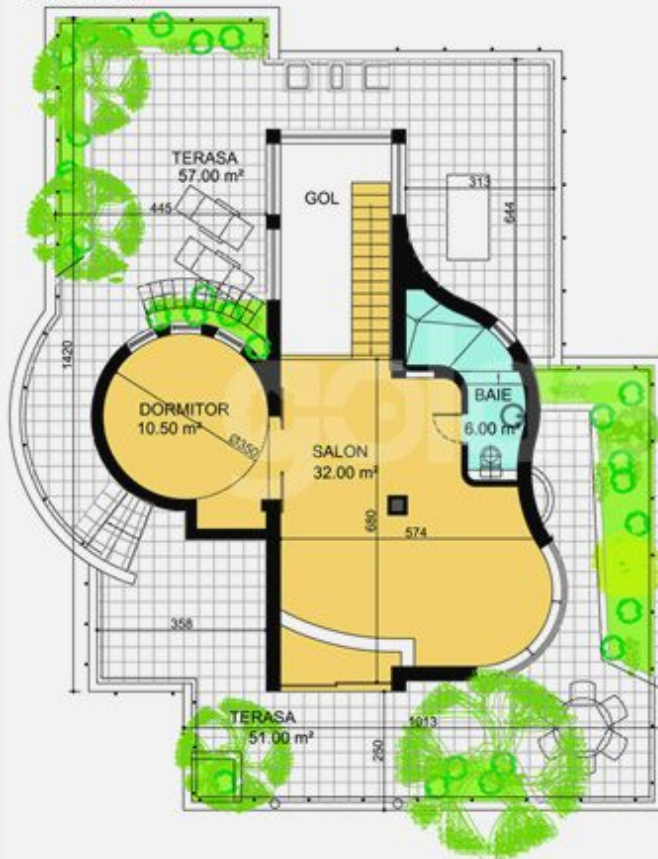
PLAN ETAJ 3

GoldenKey Premium Real Estate | Bringing you home... since 2006